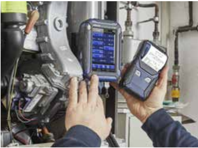
Printout of the measured data on site.