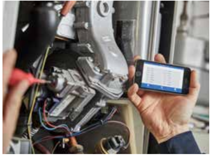
Wohler A 450 app: Displaying the measured data on a mobile device.