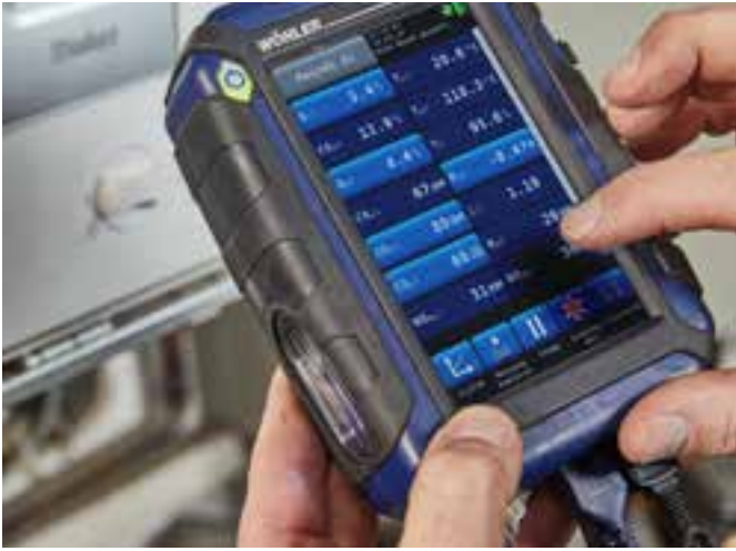
All measured values available at a glance with high-resolution display.