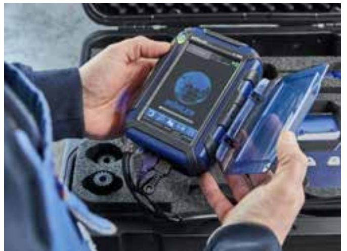
Sturdy and enclosed in a case.