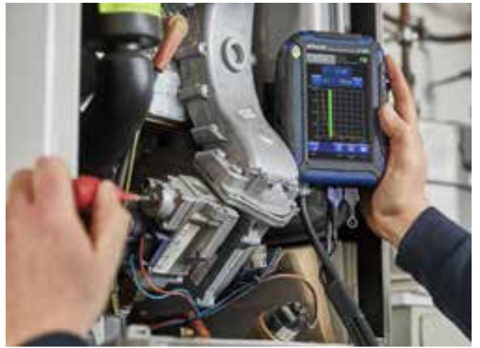
The tuning guide offers an advanced guidance to properly adjust the burner.