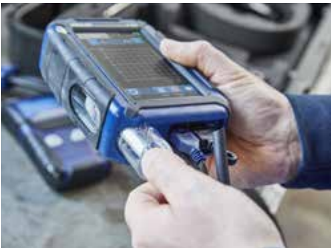
Simple maintenance – The condensate trap can easily be removed.