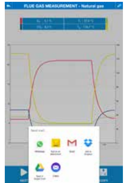
Sending the measurement data to customer