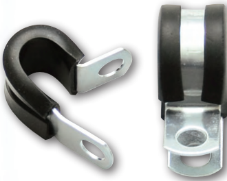
15mm band width

Secure your hose lines with these lightweight Stainless Steel Clamps lined with Neoprene rubber cushioning.