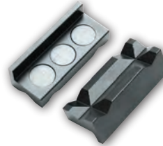
Part No. 20990