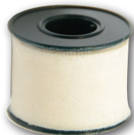
Part No. 2970

Use only the White Adhesive Tape when cutting Stainless Steel Braided Hoses. When cutting Nylon Braided hose, you must first apply a wrap of clear tape, followed by an application of the White Tape.