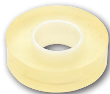
Part No. 2971