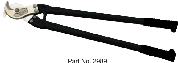
Part No. 2989