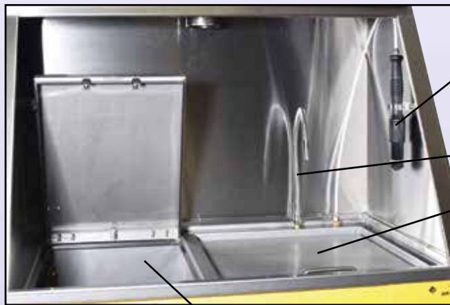
Automatic Wash Tank