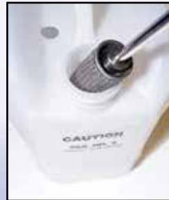
Stainless Steel Inlet Filter