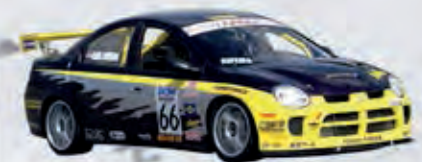
3R Automotive World Challenge Neon Srt-4