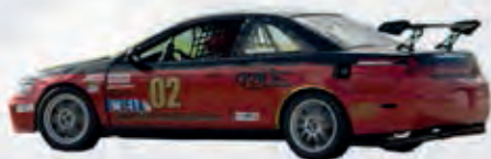
P2R Power Rev Racing FARA MP2-B Honda Accord