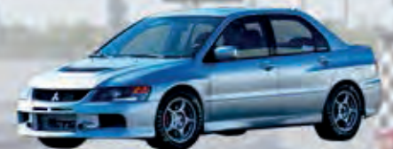
Modern Automotive Performance Mitsubishi EVO