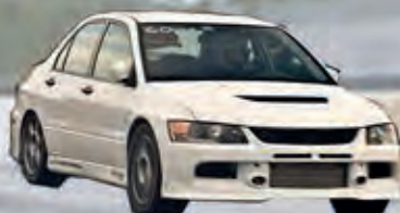
Awd Motorsports World's Quickest Evo Street Car 8.98@156mph