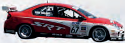
3R Automotive World Challenge Neon Srt-4