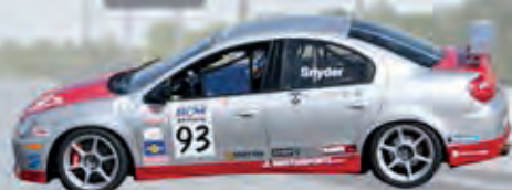
Snyder Motorsports World Challenge Neon Srt-4