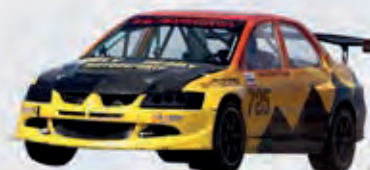
Rally Ready Motorsports Pikes Peak Mitsubishi EVO 08,09,10 Open class Winner