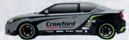
Crawford Performance 2011 Scion TC