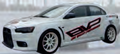
Big Valley Performance