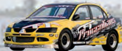
Kings Performance Mitsubishi EVO 8.87 @ 160 Mph