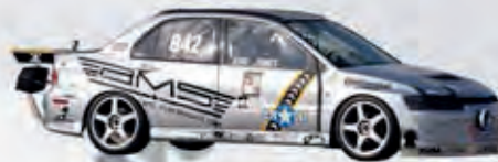
AMS Performance Worlds Fastest Standing Mile Mitsubishi EVO 228 Mph