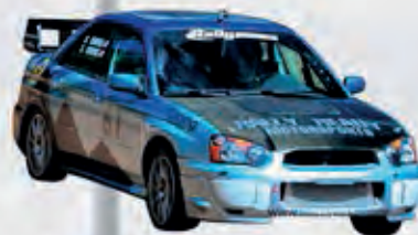
Rally Ready Motorsports Pikes Peak Rally Subaru