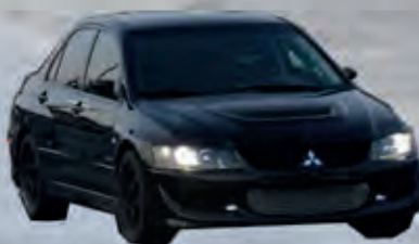
Awd Motorsports Mitsubishi Evo 8.75 @163Mph