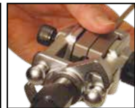
S-lock for quick assembly