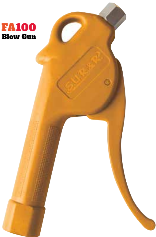
FA100 Flex Air Blow Gun