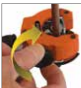
Cut tubing to desired length