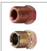
Create and Connect Extension Using: 3/16" BR145 & BR-EZ100 (sold separately) OR 1/4" BR1150 & BR-EZ200 (included in FA14 kit)