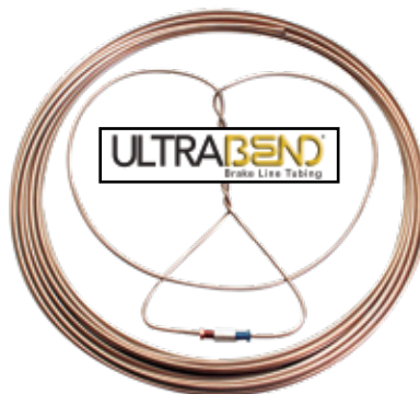
BR-EZ200 UltraBEND® Tubing

Includes: Flex Air Blow Gun (FA100), UltraBEND® Tubing (BR-EZ200 – 1/4"), and Tubing Connectors (BR1150 – Qty 4 – 1/4" nuts)