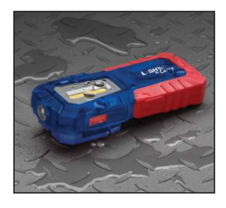
Splash / Water Resistant