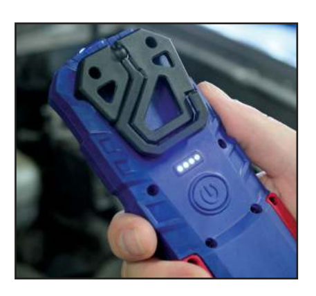
Belt Clip and Display Status