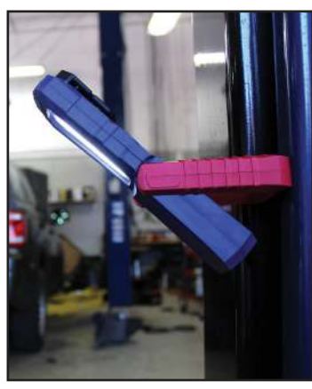
180° Swivel Action Magnet Mounting

All models feature a 180° swivel design for easy adjustment and a powerful mounting magnet to provide stability wherever it is placed. Also, we've added a mounting hook and belt clip for ideal positioning and easy mobility. Each model features automatic charging and includes a wall charger with braided USB cable.