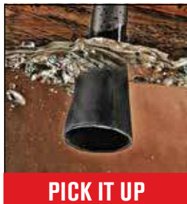
PICK IT UP