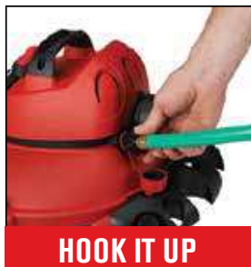
HOOK IT UP