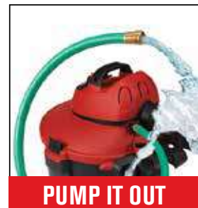
PUMP IT OUT