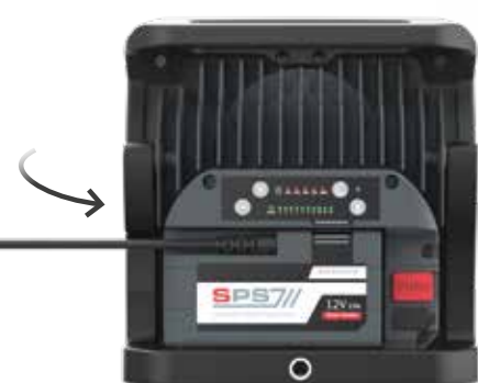
Use battery charger directly on the lamp as power supply