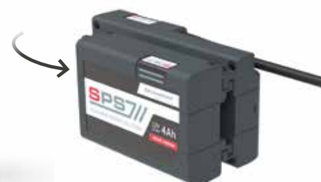
Charging exchangeable battery