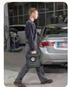
SPS system provides light for the entire work day