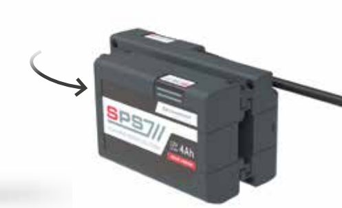
Charging exchangeable battery