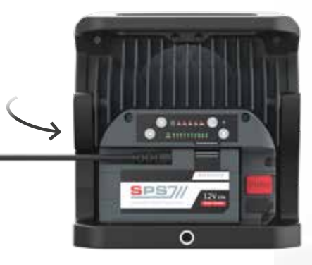
Use battery charger directly on the lamp as power supply