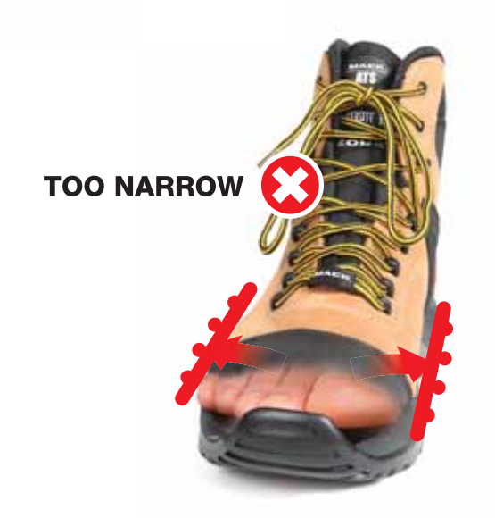
ACTION: If the outside of the foot is hanging over the midsole a different style of boot is required.

ACTION: If the boots are too tight but the foot is on the midsole a half size larger is required.