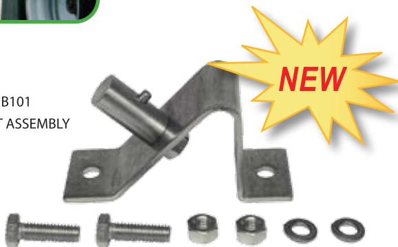
Stainless steel mounting hardware included