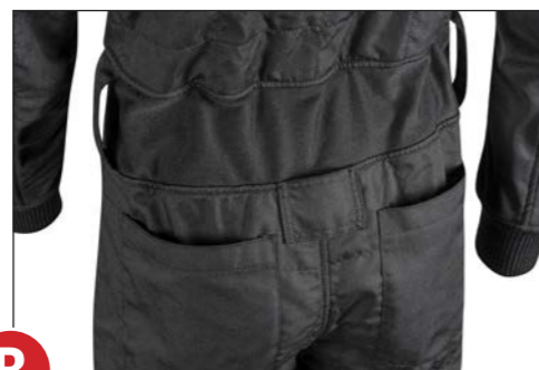
B RADIO OR ACCESSORIES LOOP