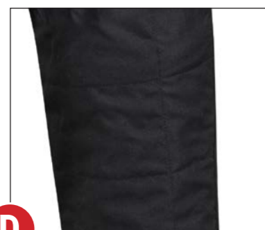
D KNEE PADDING