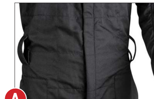
A DOUBLE BELT LOOP

AVAILABLE WITH TS-9 - TS-7 - TS-3 HOMOLOGATION