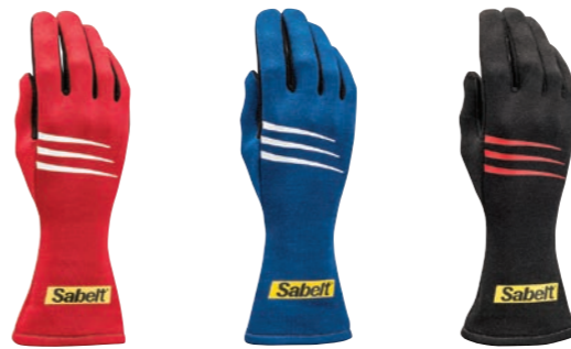
RFTG03RS.. RFTG03BL.. RFTG03NR..

FIA APPROVED SIZES 8-12 MANUFACTURER: SABELT MODEL: CHALLENGE TG-3 FIA STANDARD: 8856-2000 FIA 8856-2000