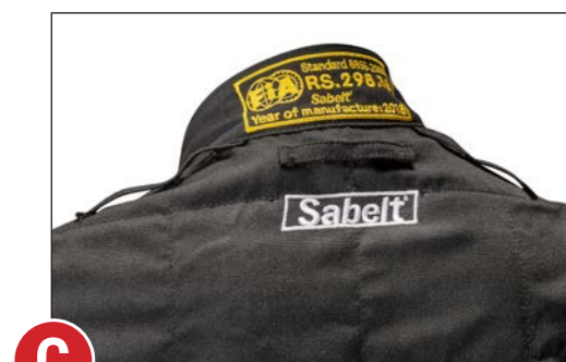
C SHOULDER WIRE CORD