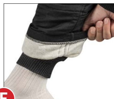
E BOOT CUT