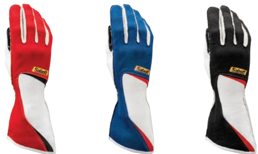
RFTG07RS.. RFTG07BL.. RFTG07NR..

FIA APPROVED SIZES 8-12 MANUFACTURER: SABELT MODEL: DIAMOND TG-7 FIA STANDARD: 8856-2000 FIA 8856-2000