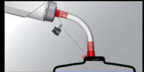
Hose Bender = Easy entry and exit