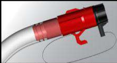
Leak proof press-on cap with lanyard

RESULT: Hooking the cap to the hook creates a bend in the hose, creating a natural arch. This helps the user get the hose into the tank!