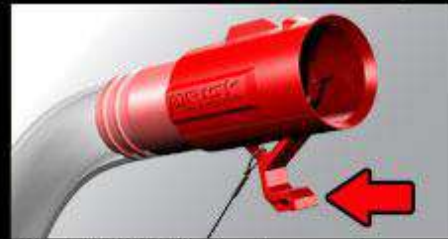
The Stability Hook makes pouring easy