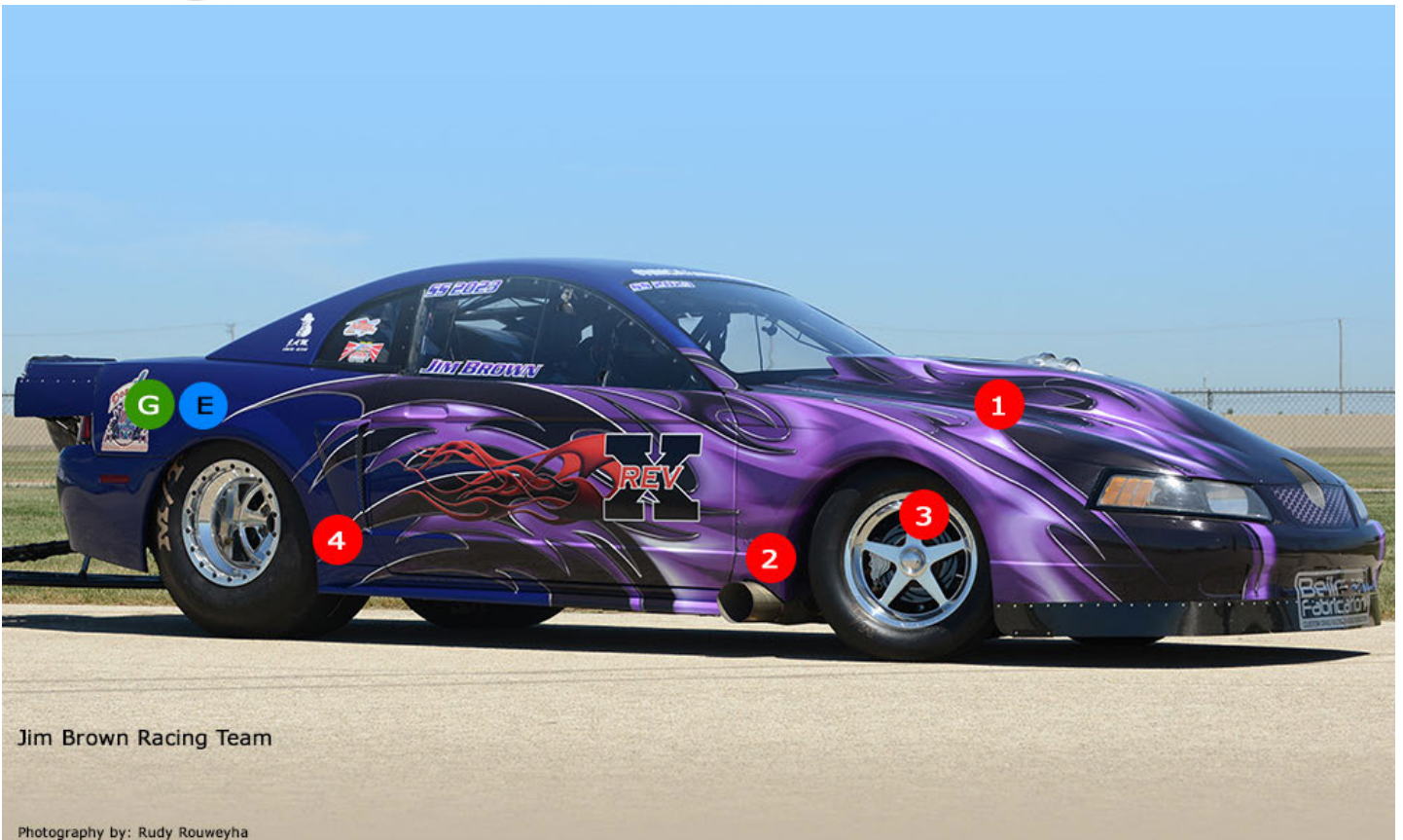
Jim Brown Racing Team