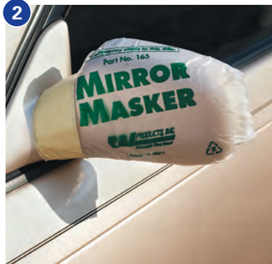
2 Tape-off open end. Total mirror masking protection against refinish overspray in seconds. Built-in "cling" wraps the mirror.