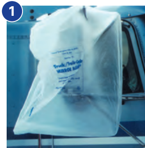
1 Slip Mirror Masker over mirrors and rods...

Designed to provide total mirror masking protection against paint overspray, dust, dirt and other contaminants during refinish repair.