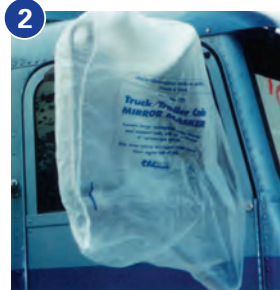
2 ...and tape against cab.