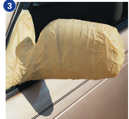
3 Eliminates costly 2" tape masking.