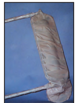
Eliminate costly 2" tape masking!