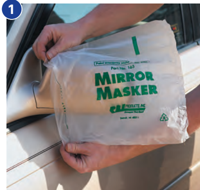
1 Slip on MIRROR MASKER over side-view mirror.

Reduce Side Mirror Masking Costs (labor & materials) by 50% - 75%!