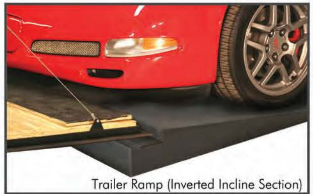
Trailer Ramp (Inverted Incline Section)

Think of the Track & Trailer Combo as the perfect ramp triple header.....use it to work on your car in the garage, load your car onto your trailer or use it as a wheel crib instead of jack stands. The bottom section of the service ramps can be removed to allow access from the side of the car as well from the front.