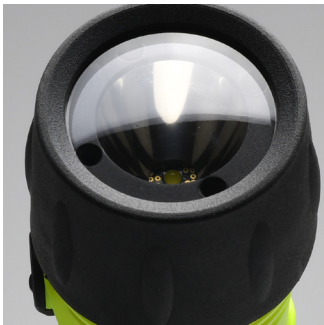
POWERFUL SINGLE MAXBRIGHT LED