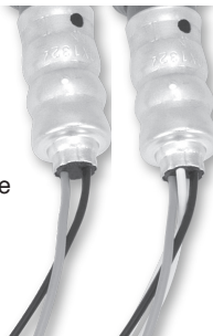
Unheated Type 1-2 Wires

Refer to illustration for appearance differences of the two sensor types.