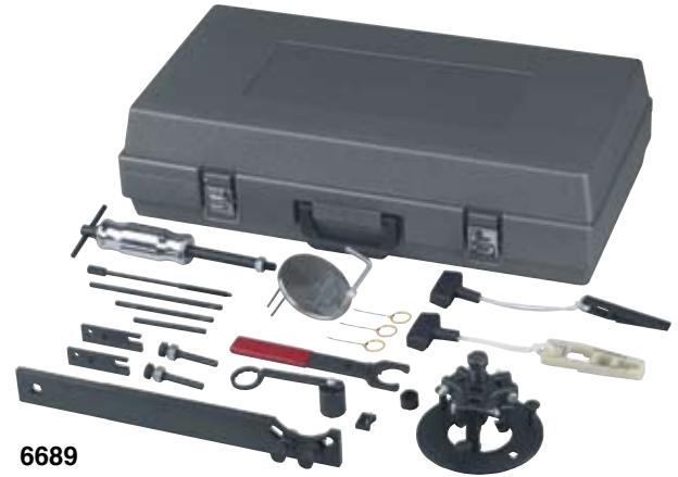
Chrysler / Jeep Cam Tool application chart for 6689 Note: Some applications require more than one tool to accomplish the task.

No. 6689 – Chrysler/Jeep cam tool set. Wt., 25 lbs.