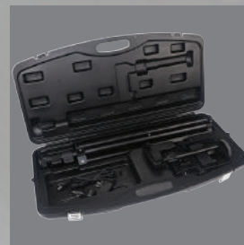
Area Light and Tripod in Carrying Case