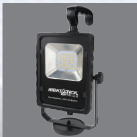
Area Light with Magnetic Base