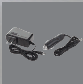
AC/DC Power Supplies