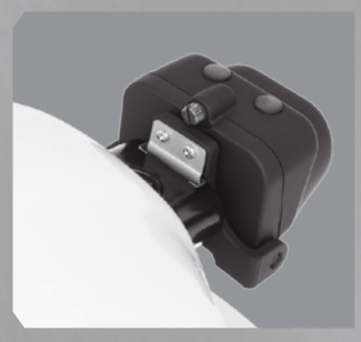
Tool-less secure pressure fit mounting