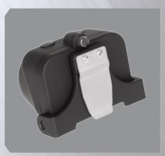
Integrated stainless steel clip