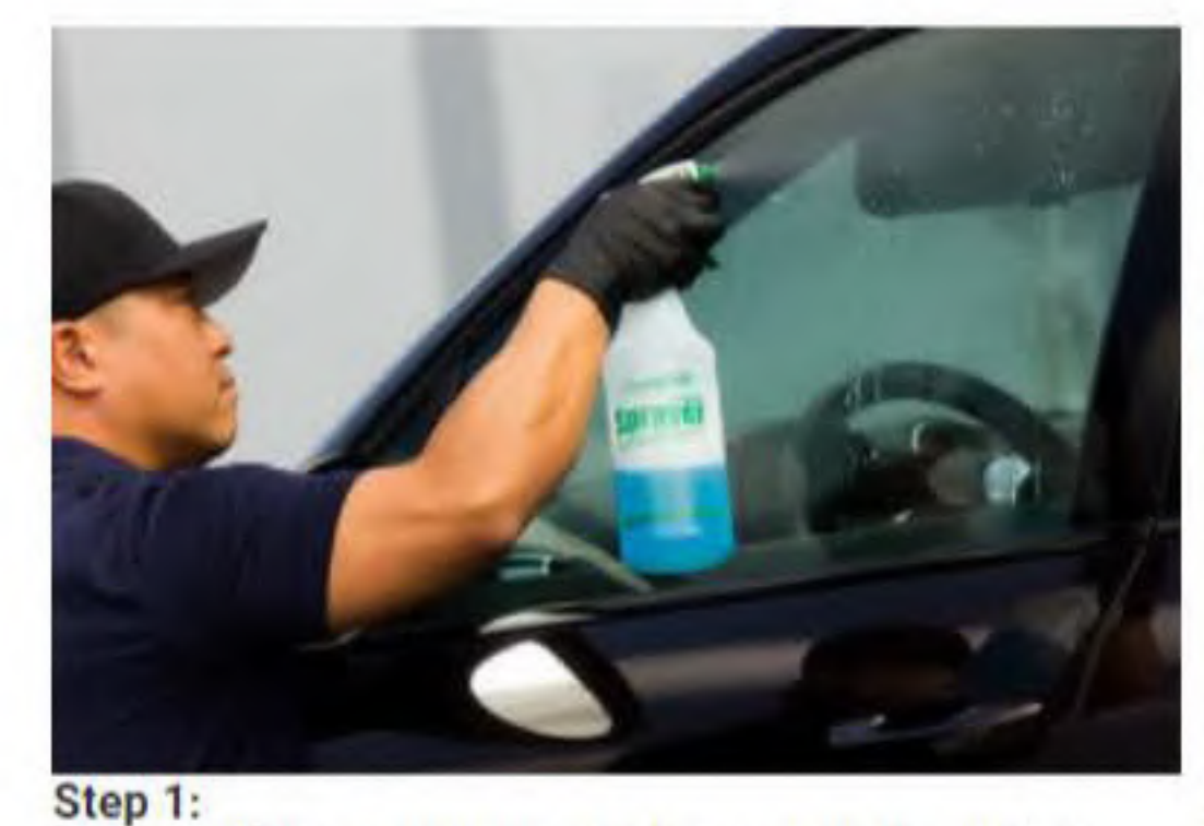
Spray sufficient amount of lubricant on the vehicle glass surface

Note: Do not allow the lubricant to run dry on the surface.