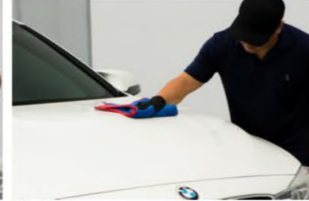
Step 3: Wipe and buff dry residual lubricant off the paint surface using light pressure.

NOTE: Work in a 12"x 12" area at a time. Do not allow lubricant to dry on the surface