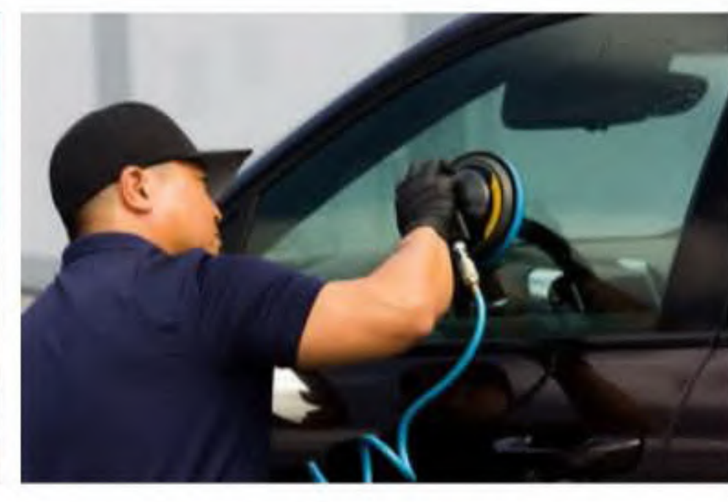
You can also use Autoscrub handheld sliding Autoscrub across the lubricated glass surface in a back and forth motion.

Use a DA on low speed slide Autoscrub across the lubricated glass surface with light to medium pressure.