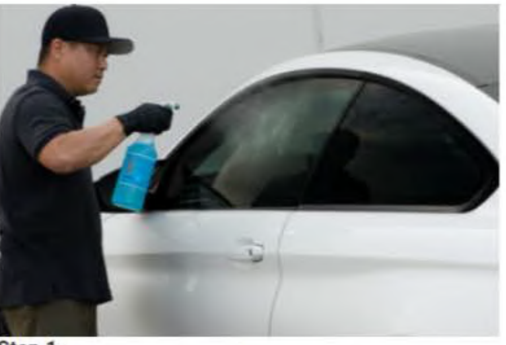
Step 1: Spray sufficient amount of lubricant on the glass surface.

NOTE: Do not allow the lubricant to run dry on the surface.