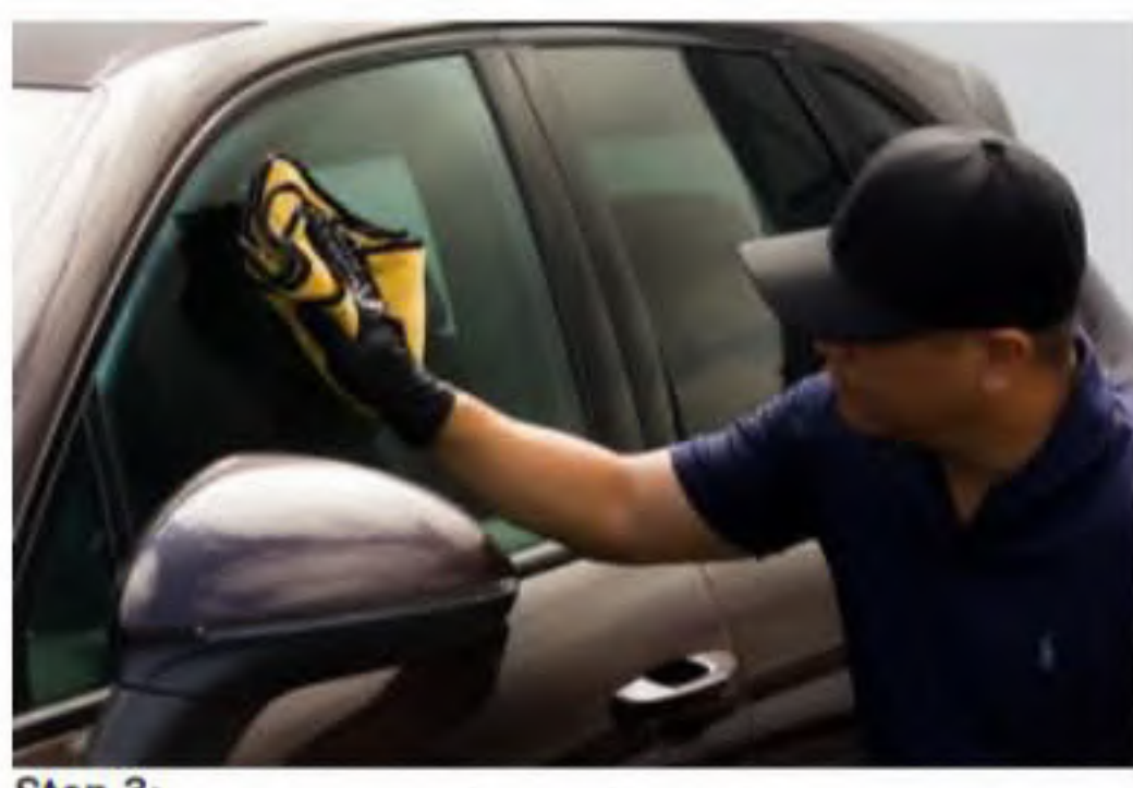
Step 3: Wipe and buff dry residual lubricant off the glass surface using light pressure.