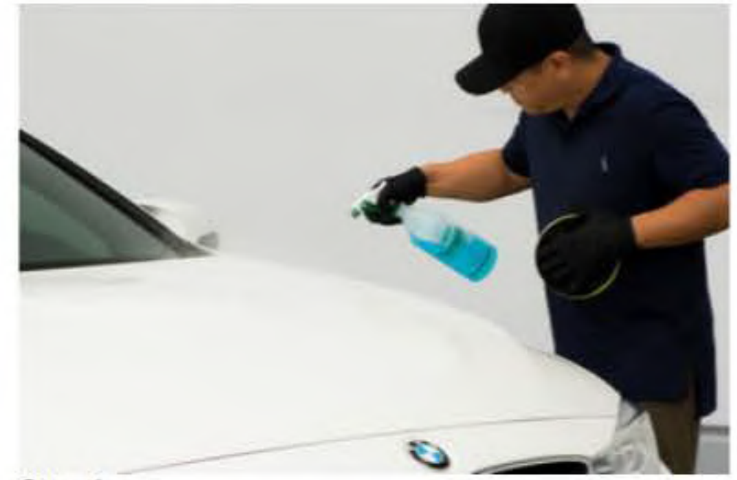
Step 1: Spray sufficient amount of lubricant on the paint surface.

NOTE: Do not allow the lubricant to run dry on the surface.