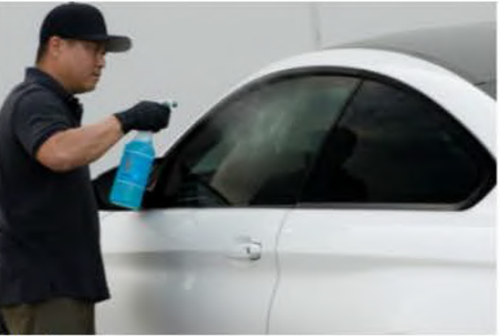
Step 1: Spray sufficient amount of lubricant on the glass surface.

Wipe and buff dry residual lubricant off the paint surface using light pressure.