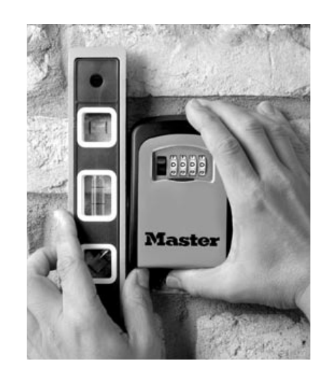
Mark the position of the screw holes on the surface