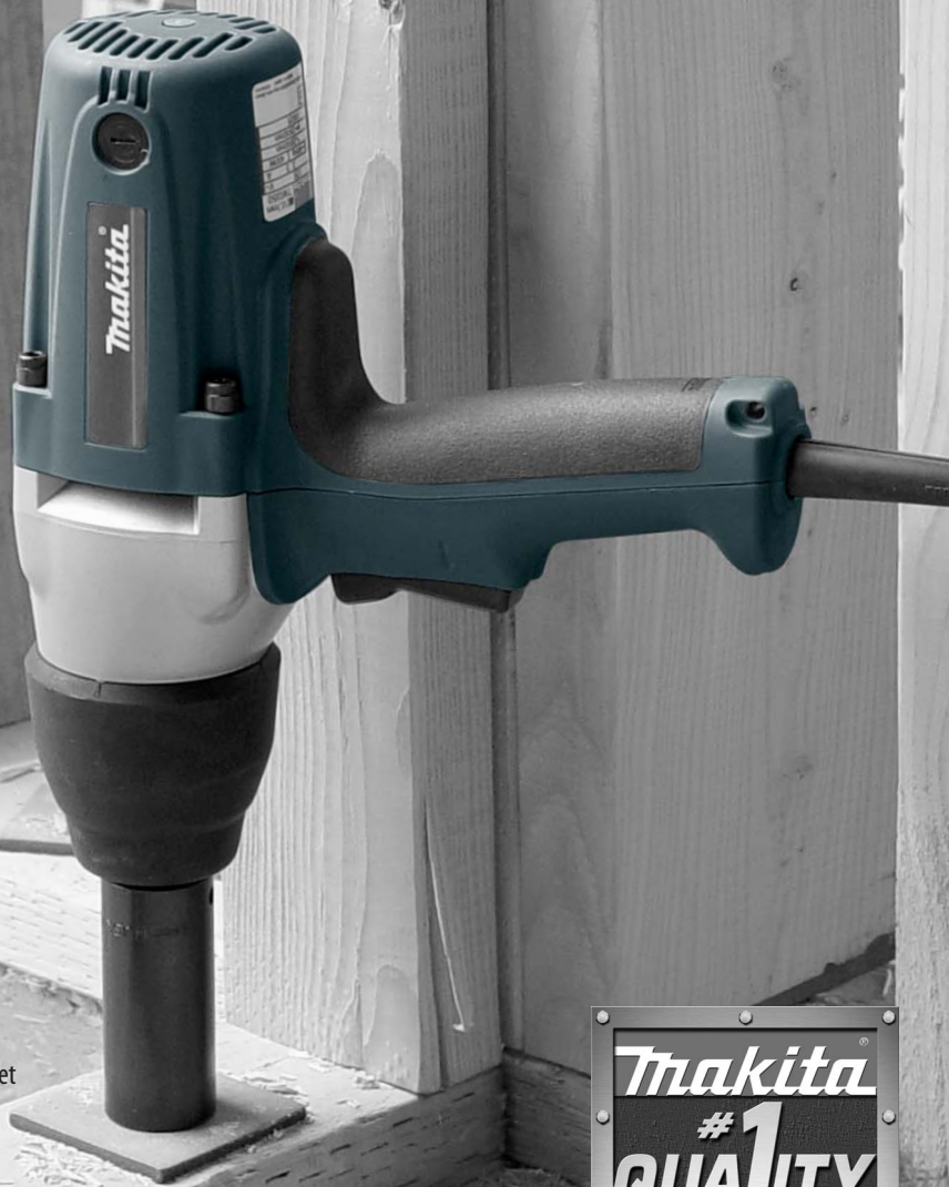
Shown with optional socket

Ideal for Framers, Anchor Setters, Deck Builders, Installers, Automotive Mechanics, Dismantlers, and Many Other Applications