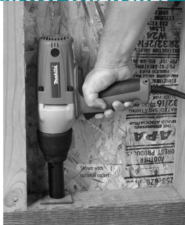
Shown with optional socket