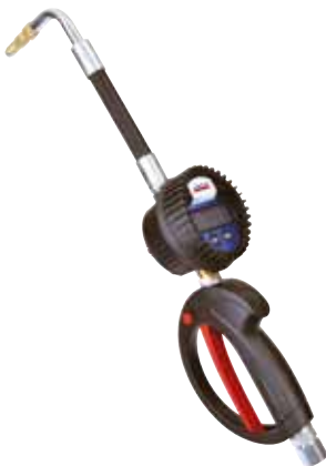
Model 980 electronic lube meter