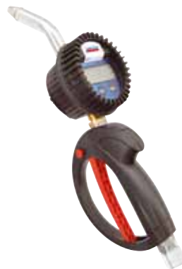
Model 981 electronic lube meter

Control valve, meter, flexible 90° extension, manual tip and instruction manual