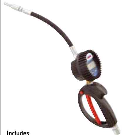
Model 982 electronic lube meter

Control valve, meter, 5.5 in. (14 cm) rigid spout, automatic tip and instruction manual