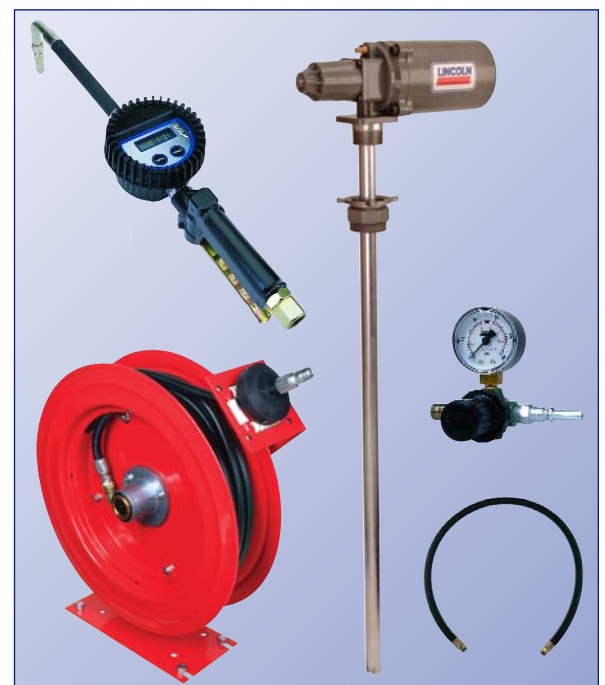
Model 4493 system for mounting pump and reel on tank