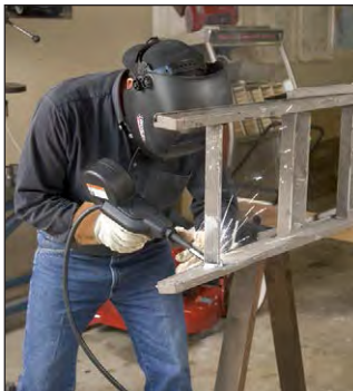
Great For Projects or Repair

Our low-priced spool gun is your most reliable aluminum feeding solution.