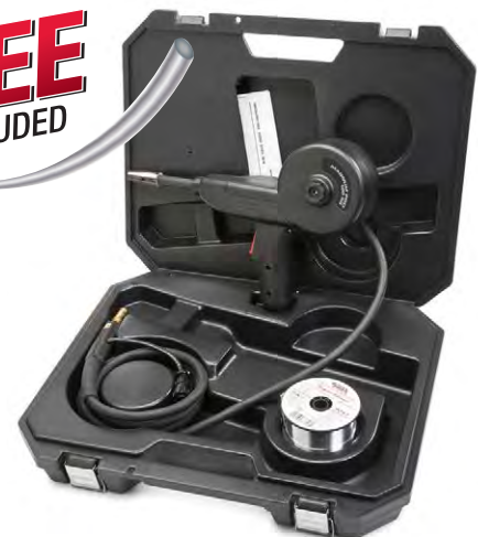
Complete Kit. No bulky module required. Order K3269-1