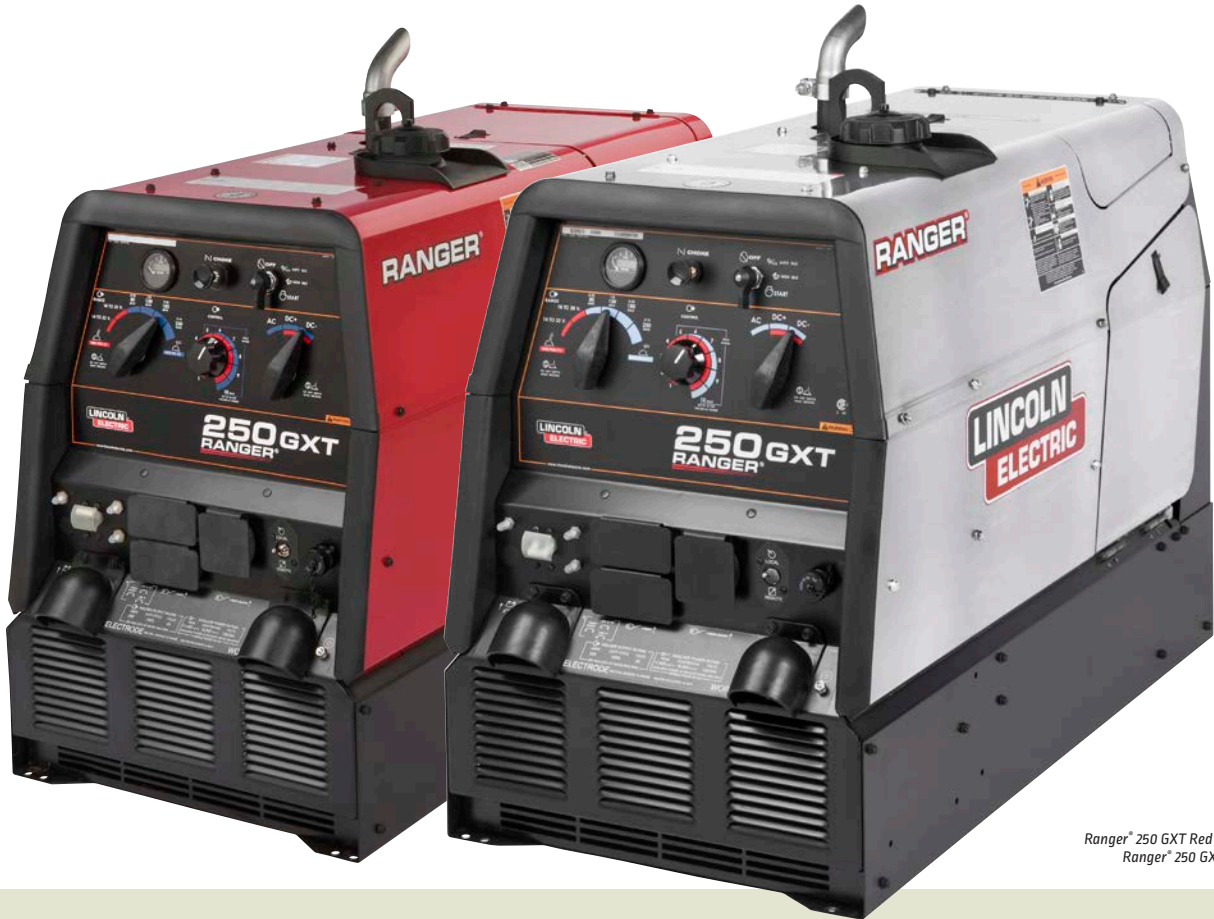
Shown: Ranger® 250 GXT Red Paint (K2382-4) and Ranger® 250 GXT Stainless (2382-5)