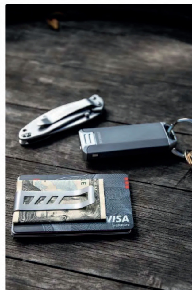
CONFIGURED WITH MONEY CLIP

And the best part... the bottle opener works with your credit cards in place.