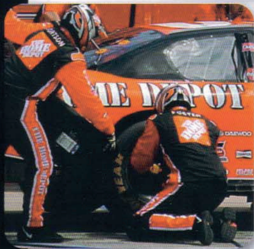
Tony Stewart, 2002 Nextel Cup Champion