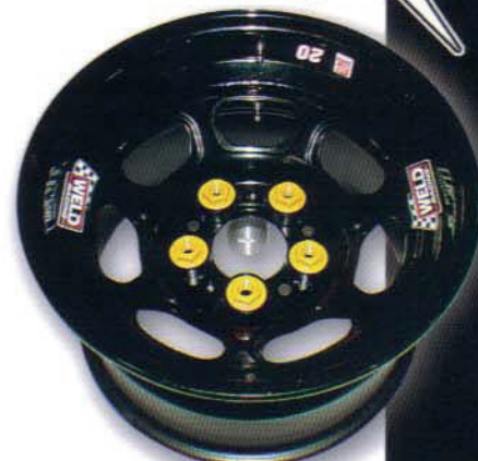
Pit Wheel Practice Kit with Wheel #1 KRC-8223

NOTE: All items can be purchased individually or as a kit by using specified part numbers