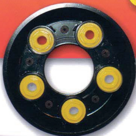
Pit Wheel Pit Box Kit #3 KRC-8225