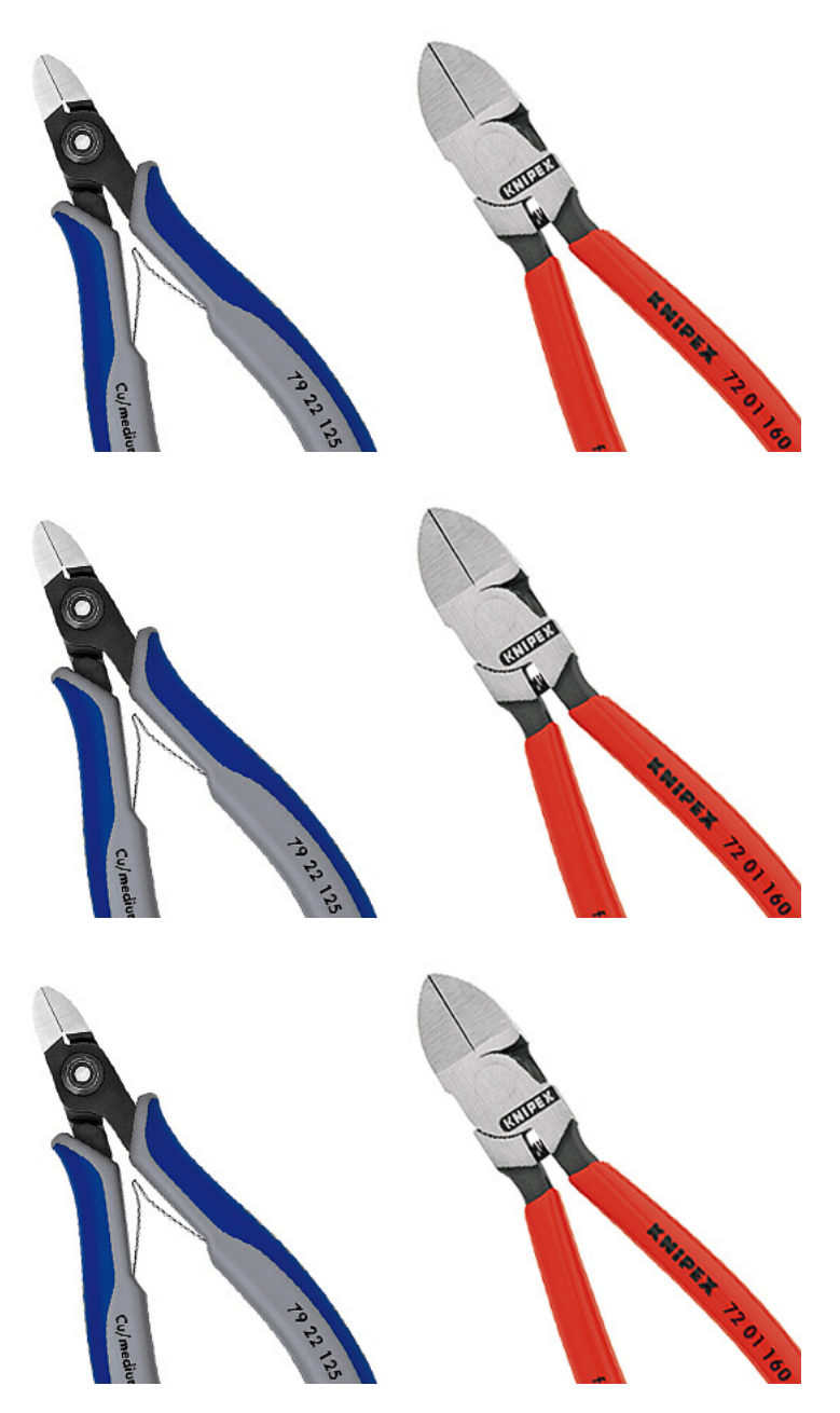
The frequently used 78 models (Electronic Super Knips®) are almost at the limit of their load-bearing capacity when cutting cable ties, especially in the case of wide cable ties or when they are cut using a fast cutting movement: the speed increases the friction.