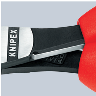
74 12: Opening spring in deactivated position

compared to conventional diagonal cutters of the same length. With forged-on joint axle.