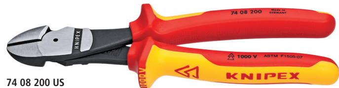
74 08 200 US