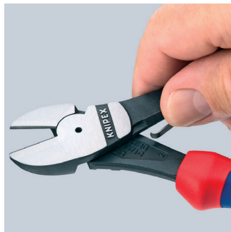
74 12: Activated opening spring by pressing down with your thumb