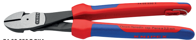
74 02 250 T BKA