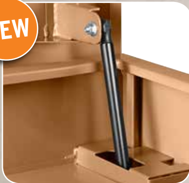
ANTI-SLAM LID Gas strut supported lid to control closing speed