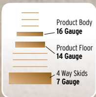
STEEL GAUGE CONSTRUCTION