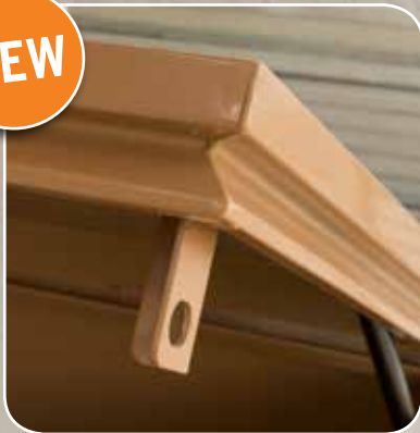
3 SIDED EASY GRIP LID Continuous ergonomic grip for easy access