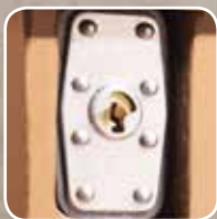
INDEPENDENT WATCHMAN IV LOCKS