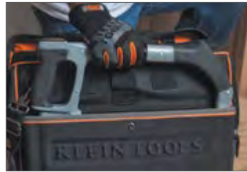
Top-loading hacksaw pocket with protective plastic lining.