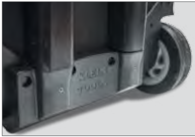
Molded kick plate to protect from the elements.