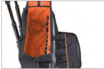
Wide open interior to accommodate large tools.