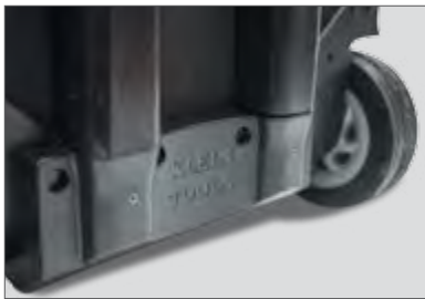
Molded kick plate to protect from the elements.