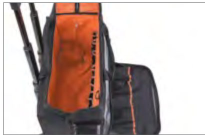
Wide open interior to accommodate large tools.