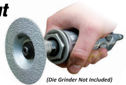
(Die Grinder Not Included)

The 3-in-1 Diamond Grinding Wheels last longer and perform better than traditional grinding wheels. They maintain their size and shape throughout their cutting life ensuring consistent reach and performance. The wheel's innovative, diamond-abrasive coating allows for fast cutting, back cutting, gully grinding and bead finishing with far less sparks and odor. The #8120 and #8151 are professional solutions for professional metal workers.