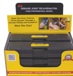
6-Pack Display #7862-6PK