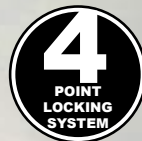
PICTURED: 8 Gun RTA Electronic Safe