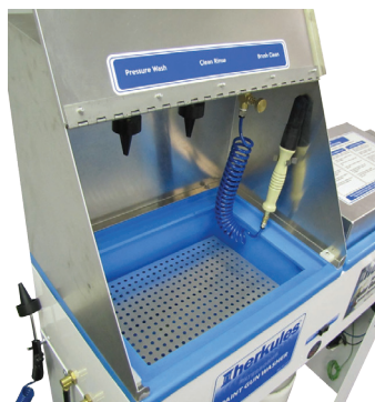
G520 manual cleaning tank

Enjoy thorough single-handed cleaning of EITHER waterborne or solvent paint guns with these two lightweight units. The Quick Clean G507, with its powerful pump, can go anywhere an airline can, while the G45 Fast Track Paint Gun Washer is powered by Herkules Sparkle Clean Blast, enabling portable pumpless cleaning practically anywhere.