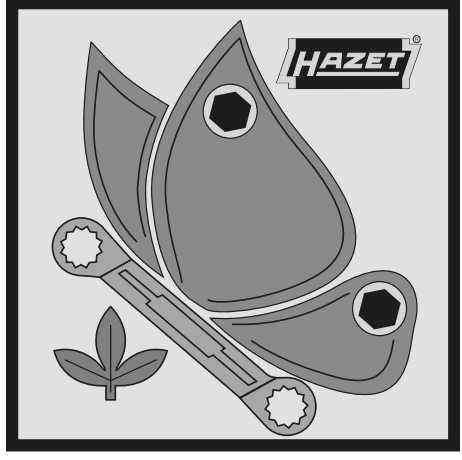
HAZET – environmental protection is of fundamental importance to us.

Reducing environmental pollution and preserving the environment are at the heart of our activities.