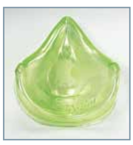
Hygiene Guard storage cap keeps respirator clean and prevents damage to the facepiece storage.

Rugged, engineering-grade ABS plastic for frame and cartridges provide durability and trouble free use.