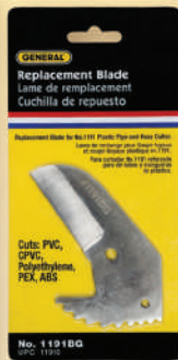
No. 1191BG UPC: 1191