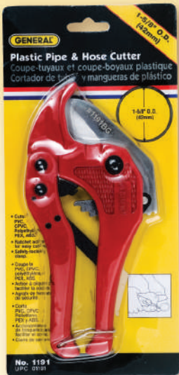
No. 1191 UPC: 01191

The extended handles provide extra leverage for tough cuts. The six-click ratchet holds the blade while you adjust your grip to increase pressure. Aluminum body is lightweight and corrosion resistant.