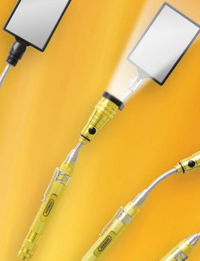
91560 Telescoping Lighted Rectangular Inspection Mirror