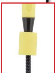
No. 70390 24" (610 mm)