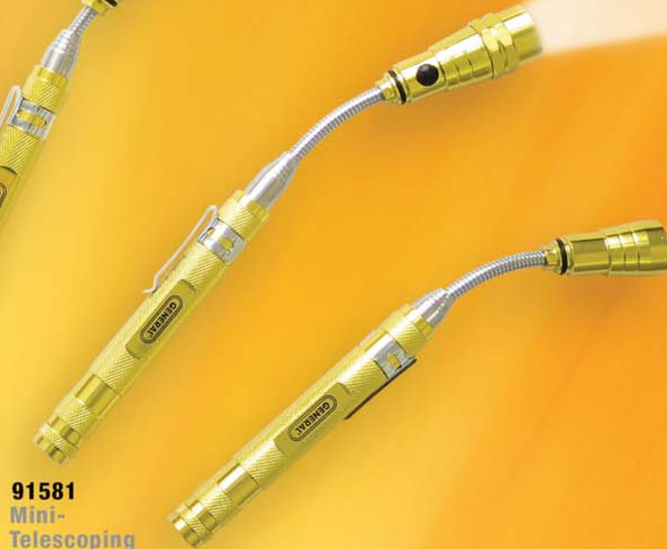
91581 Mini- Telescoping Lighted Magnetic Pick-Up