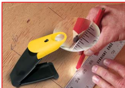
• Hands-Free Use