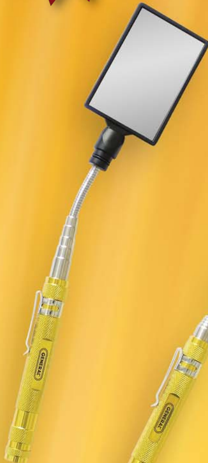
90560 Telescoping Rectangular Inspection Mirror