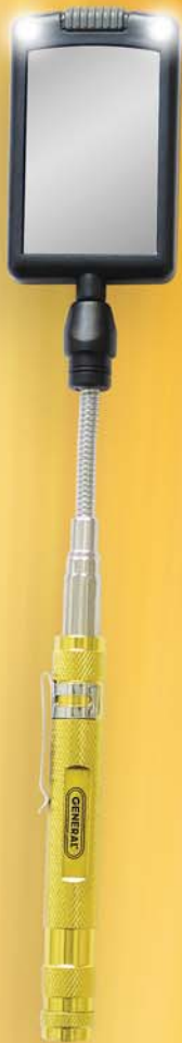
92560 Telescoping Lighted Rectangular Inspection Mirror