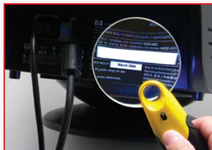
• Extra-Bright LED