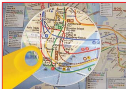
• 3x Magnification, 6x Inset Lens