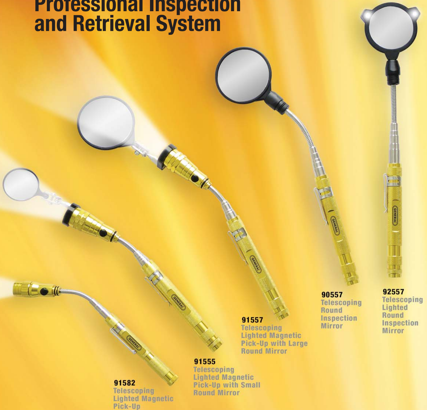
91582 Telescoping Lighted Magnetic Pick-Up