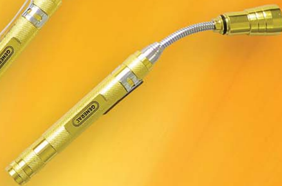
91383 Telescoping Magnetic Pick-Up