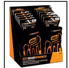
Mixed-Size Counter Display