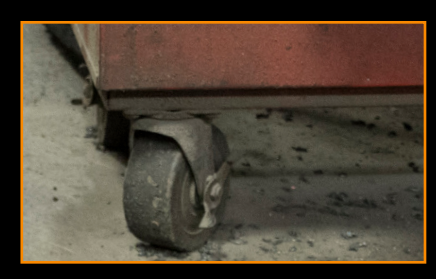
Undersized casters that can get caught in floor cracks and grates.