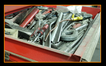
No drawer dividers to keep tools neat and organized.