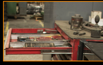
Shallow drawers have limited storage capacity and usefulness.