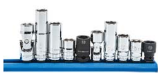
80576 - 10 Pc. 1/4" & 3/8" Drive 12 MM Socket Set