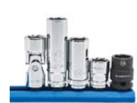
80945 - 5 Pc. 3/8" Drive 14 MM Socket Set