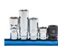
80946 - 5 Pc. 3/8" Drive 15 MM Socket Set