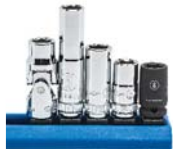
80102 - 5 Pc. 1/4" Drive 8 MM Socket Set