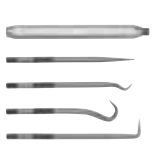
3121D 5 Pc. Set Only available as a set