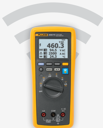
Fluke 3000 FC