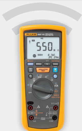
Fluke 1587 FC