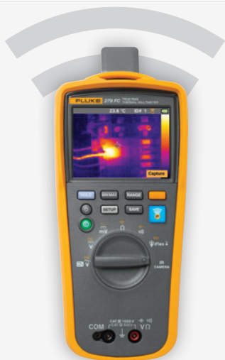
Fluke 279 FC