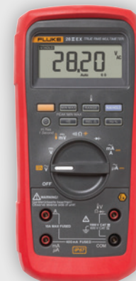
Fluke 28 II Ex