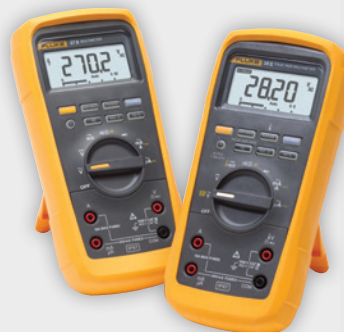
Fluke 28 II/27 II